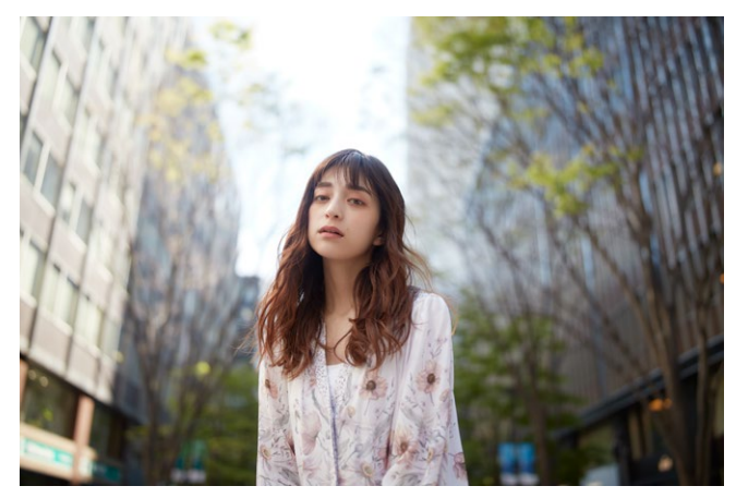
Focal Length: 35mm Exposure: F/1.4 1/800sec ISO: 100

To deliver a perfect image to people who love photography; that's our obsessive goal for all Tamron lenses. The Tamron SP 35mm F/1.4 Di USD (Model F045) is our most shining example. The exceptional image quality of this fast fixed focal lens makes it worthy of being the lens that marks the milestone 40th anniversary of the SP (Superior performance) Series. We wanted to know what kind of lens would result if we focused our accumulated expertise and technologies purely on lens performance in pursuit of image quality. In other words, could we create the greatest Tamron lens ever? All of Tamron's technical competence and new coating technologies have been compounded to finally complete the finest lens in Tamron's history. Uncompromising resolution at wideopen aperture combines with Tamron's distinctive bokeh and superior handling characteristics. Experience its performance for yourself. It will give you a better way to see the world.